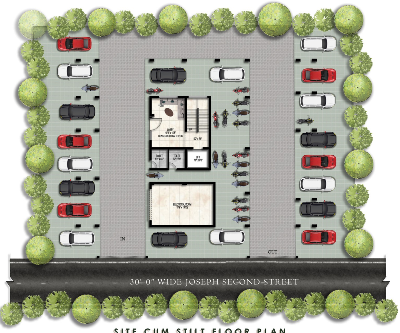
SITE CUM STILT FLOOR PLAN