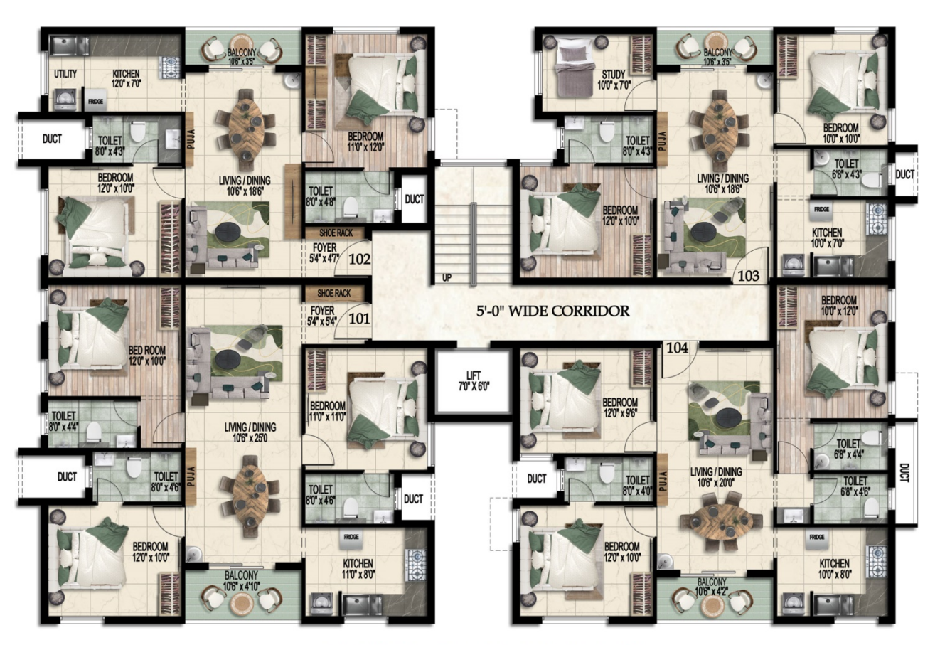
TYPICAL FLOOR PLAN(1-5)